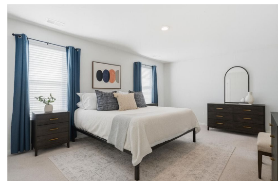
Some images AI modified