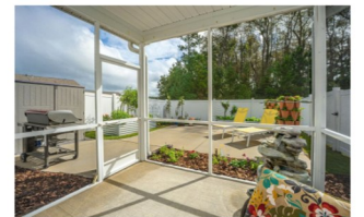
4 Bedrooms, 2.5 Baths, 1918 Sq Ft MLS #25027466