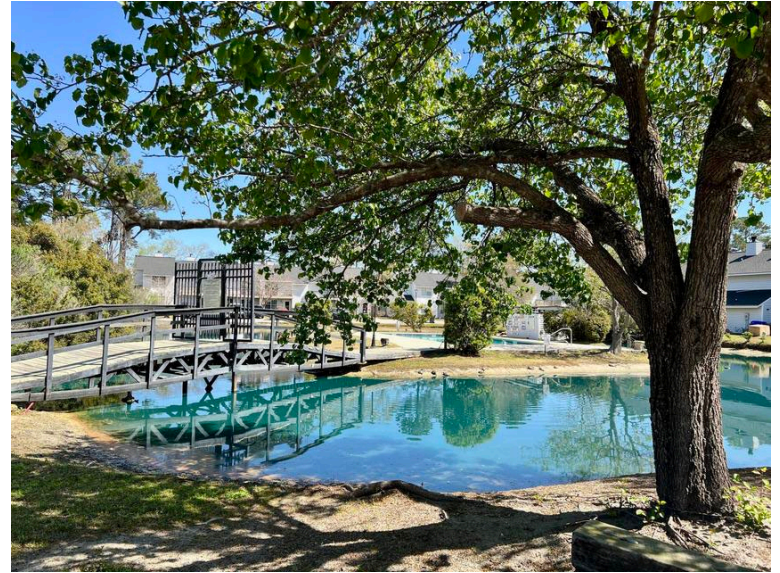
Fireside | North Charleston, SC 29418 MLS# 26006087 | $215,000