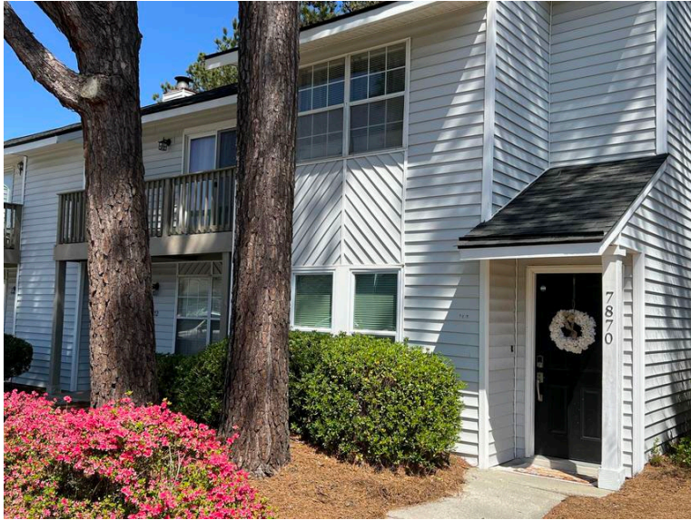
7870 Nummie Court